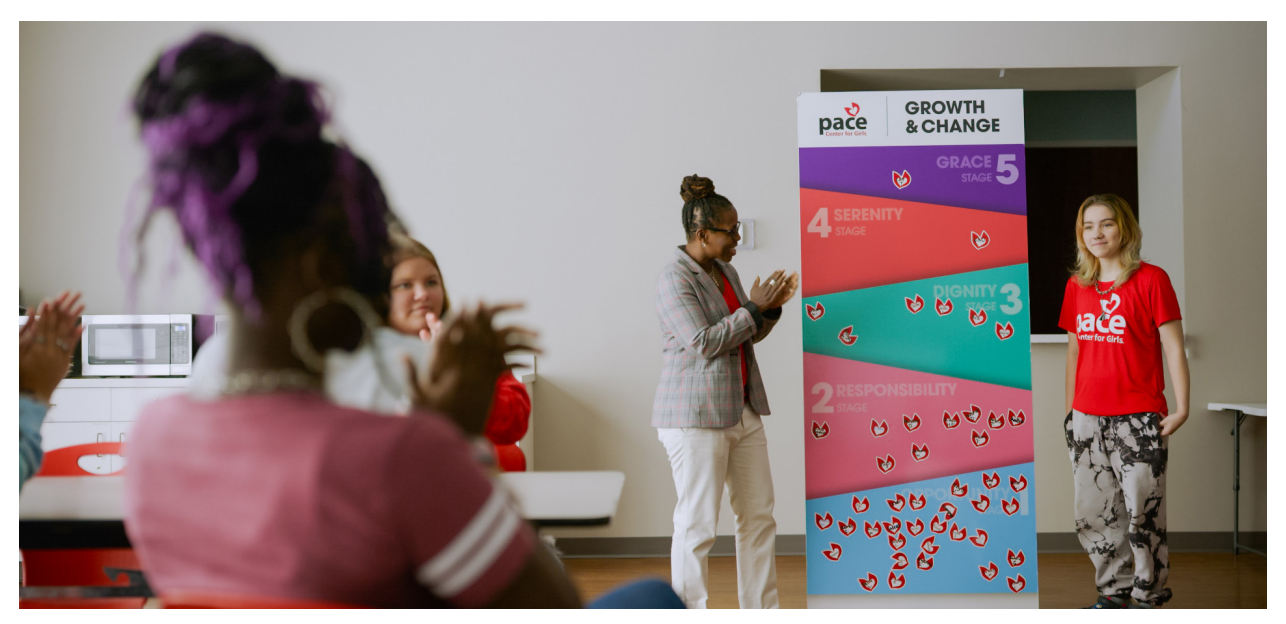
Pace Center Clay, FL, Growth & Change Ceremony, with hearts for each girl participant.