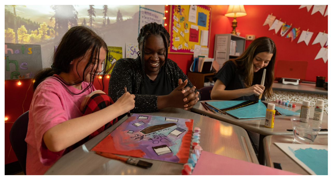
Pace Center Pinellas, FL, experiential learning session.

Where can other leaders begin? The first question to answer is whether your school system has enough informed leadership capacity, like Lyles's, to devote to culture building or could benefit from inviting a culture-building ally like EL Education or Communities in Schools to work alongside. The second question is whether you have access to content and delivery mechanisms to promote culture-building ideas to influence the way adults and students interact. In other words, are you best off building or borrowing expertise?